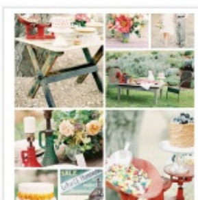
National Wedding Inspiration | Summer Solstice